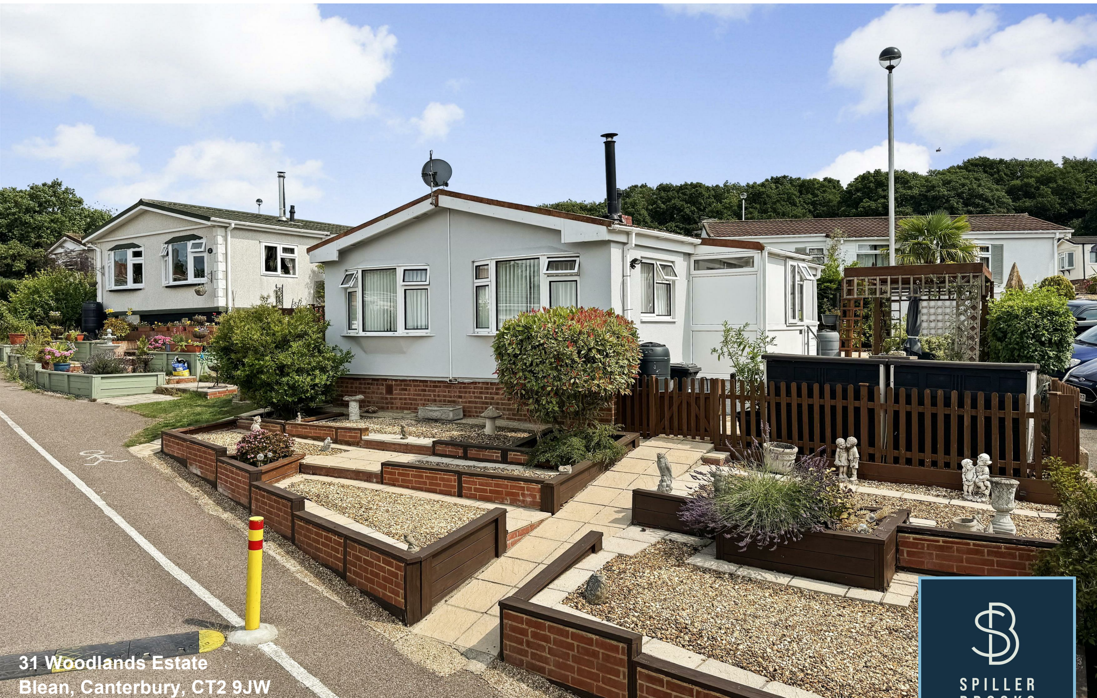
31 Woodlands Estate Blean, Canterbury, CT2 9JW